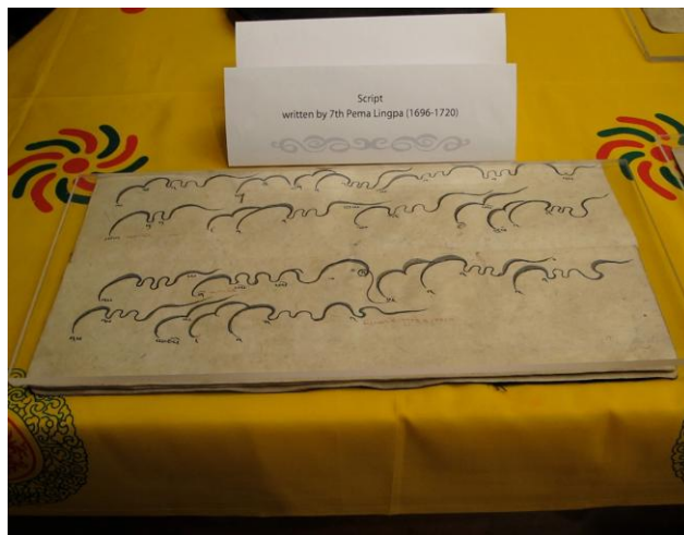
Script from Pema Lingpa