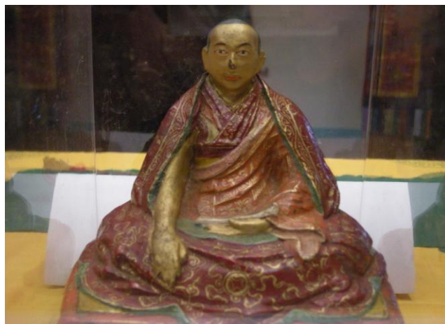
Statue of 3 rd Pema Lingpa